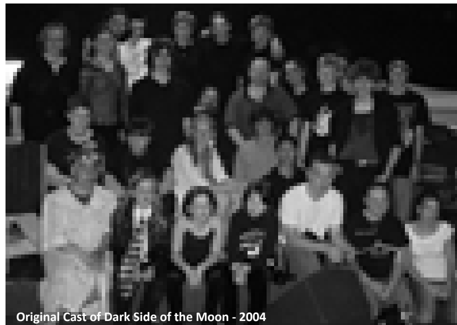
Original Cast of Dark Side of the Moon - 2004

Pink Floyd's albums "Dark Side of Moon" (1973) and "Wish You Were Here" (1975) are seen as two of the most important rock albums ever recorded, and document the band's experiments with odd time signatures, adventurous songwriting, and abstract sounds created through the use of synthesizers. Both are "concept albums" describing the life of guitarist Syd Barrett, Pink Floyd's mentally ill founder who left the band prior to their rise to fame in the 1970's. Alongside his story are Pink Floyd's common themes of rebellion against a dystopic record industry and disillusionment with the fame they felt strangled their creative progress.